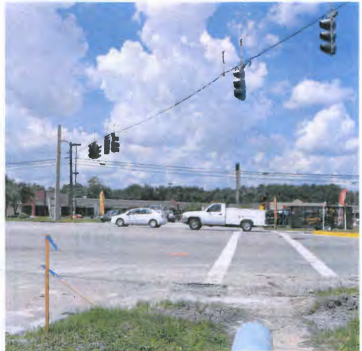
Current intersection in front of Deerfoot Village Shopping Center in Starke